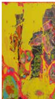
2017-10 100 x 100 cm Mixed Media, Acrylic, Industrial Paint on Canvas